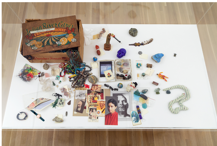
David Wojnarowicz, Magic Box , n.d. Mixed media box, 20 x 28 x 43 cm From the David Wojnarowicz Papers, Fales Library and Special Collections, NYU Courtesy the artist and Galerie Buchholz, New York