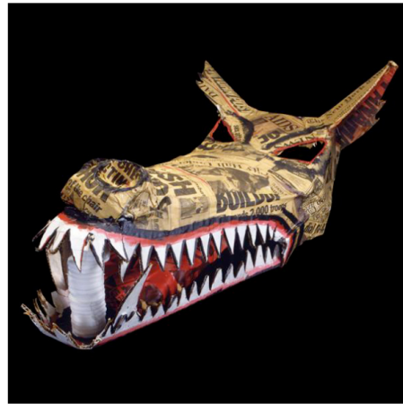
David Wojnarowicz, Wolf's head Papier-mâché mask, 26 x 19 x 14 in. Fales Library and Special Collections

are the props that Wojnarowicz used in his performances, films, photographs, and installations. An example is the wolf's head in our collection. It has been exhibited independently but it is associated with various works. He used it in Rosa von Praunheim's film Silence = Death , for instance. As a visualization of HIV, it has a complicated set of references. He constructed it in papier-mâché and it is covered with newspaper articles relevant to the AIDS crisis and the denial of federal funding for people infected with HIV. We wanted to get all of these associations in the David Wojnarowicz Knowledge Base .